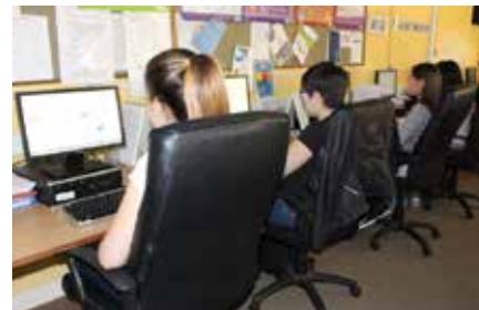
Students at work