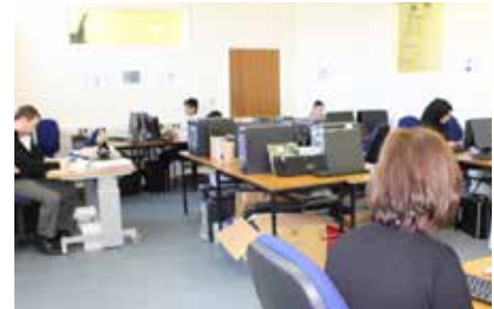
Computers Systems and Networks Students at work