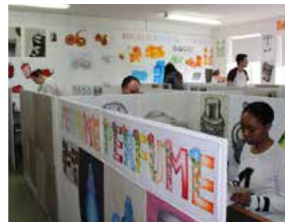
Art PLC Room