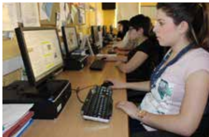
Business Administration Course students at work